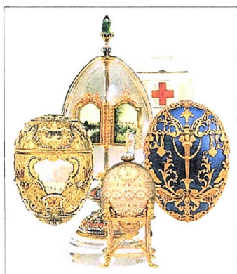
Pratt Fabergé Eggs

Below (and see attachments) are the final details for the Friday-Saturday, July 27-28, 2018, Fabergé Enthusiasts Gathering in Richmond (VA) with an add-on trip to Hillwood Museum, Estate & Gardens in Washington (DC). Both locations are offering special venues and bonuses for our group.